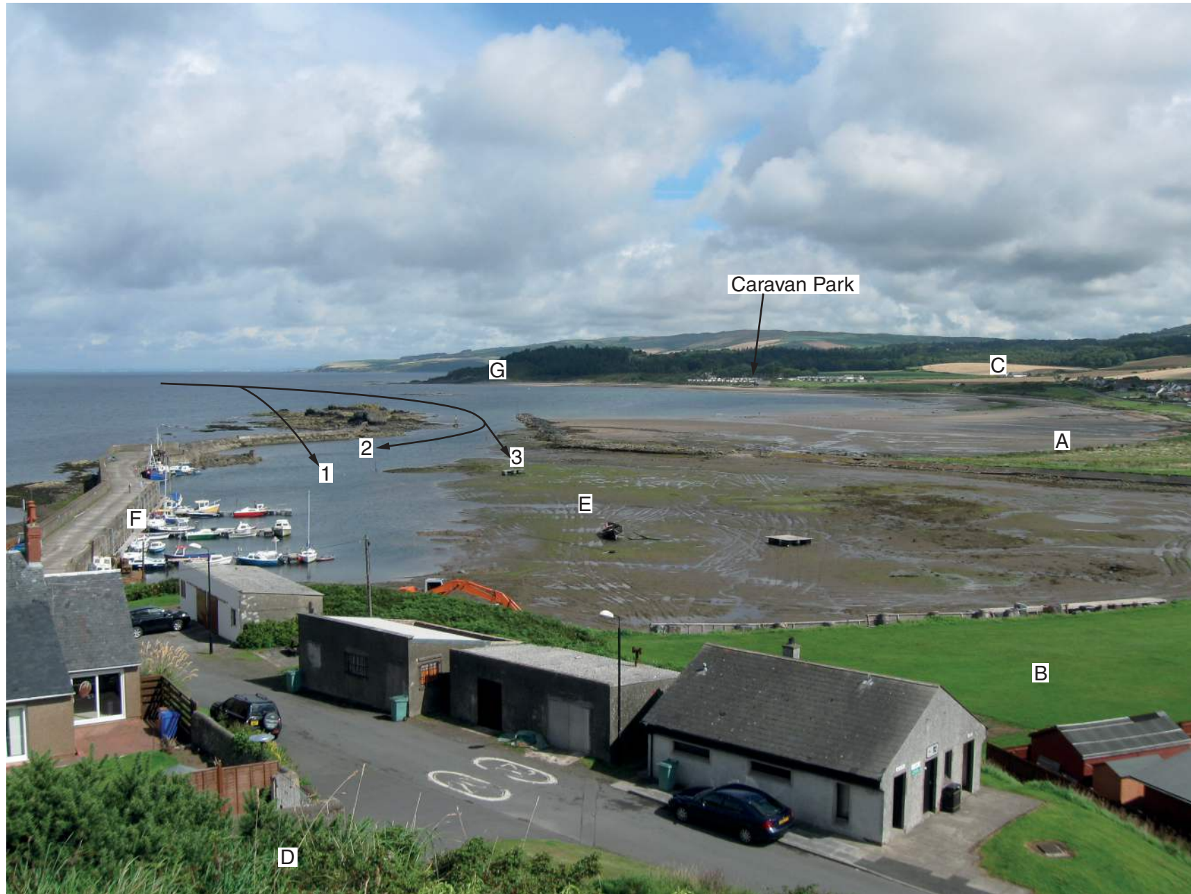
Photograph A for Question 3