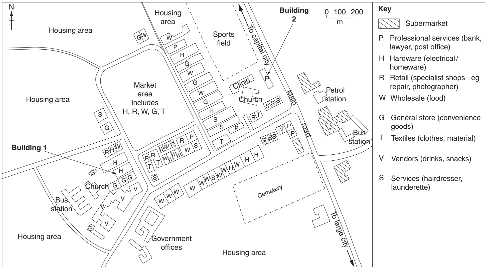
Land use map of central area